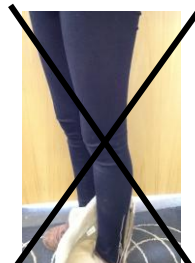
Skinny pants and pants with zippers are not uniform