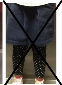
Leggings must be solid uniform color