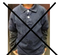
Undershirts must be uniform color